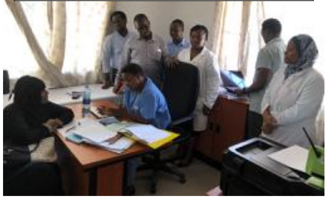
Photo: 1<sup>st</sup> patient being screened for META trial, in Amana Hospital, Tanzania

META Trial Phase 2 – we have started screening patients in Amana Hospital for enrolment in the trial.